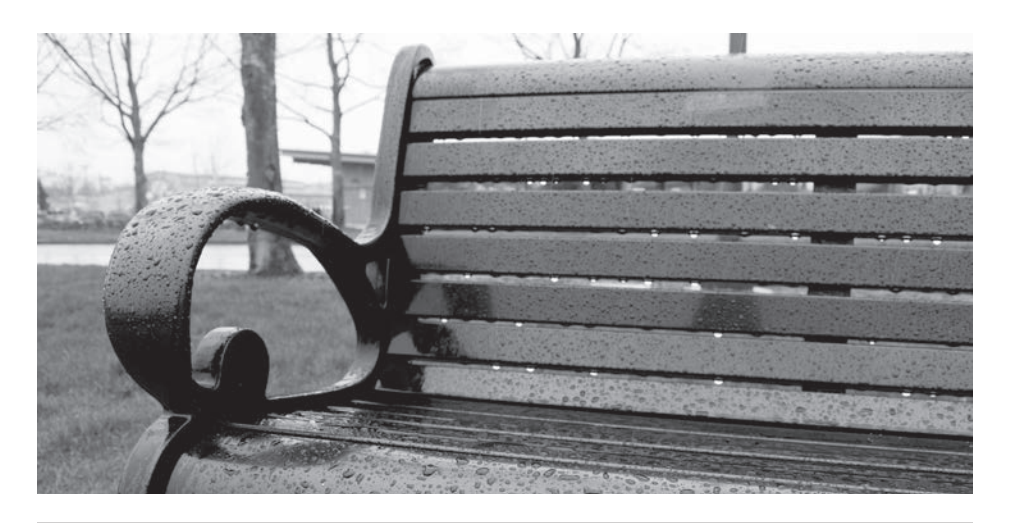
<sup>17</sup>"The Economic Cost of the Opioid Epidemic in Washington State." U.S. Senate Committee on Health, Education, Labor & Pensions, 2018.

During the 2018 legislative session, Governor Inslee also included some of the Plan's strategies and goals in request legislation (SB 6150 and HB 2489). Unfortunately, these bills did not pass. The Board believes that the components within this legislation that reflect the Plan's strategies are critically important to helping reduce health complications and deaths and reducing health disparities associated with opioid use and abuse.